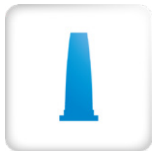
Tower flanges / joints